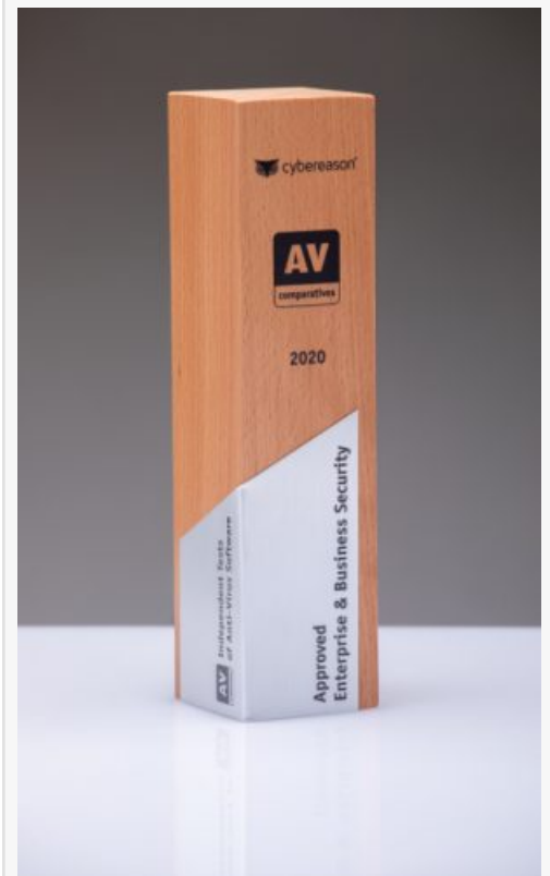
Cybereason Approved Enterprise Business Security Trophy 2020