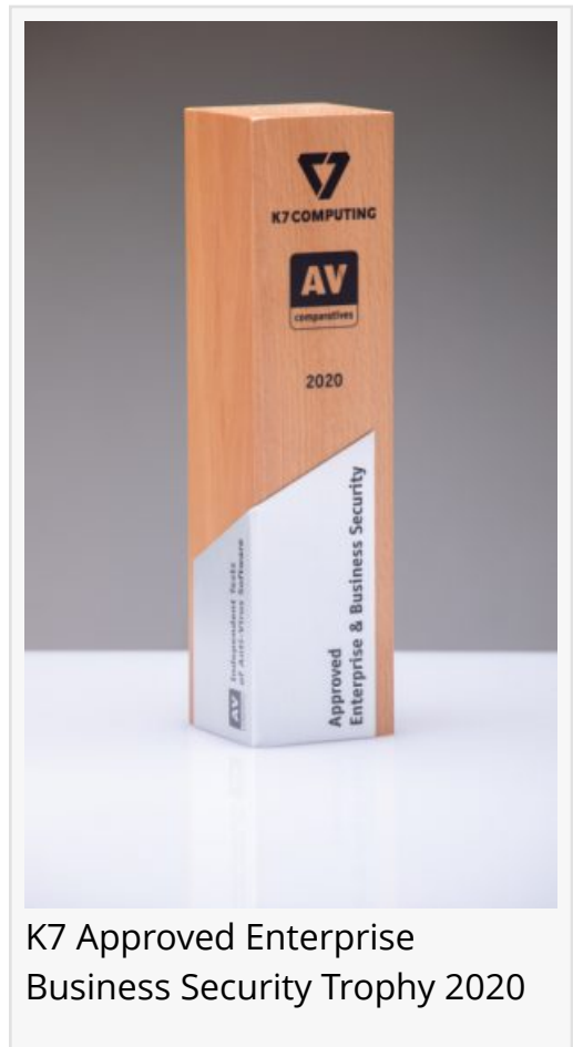
K7 Approved Enterprise Business Security Trophy 2020

This press release can be viewed online at: https://www.einpresswire.com/article/538622697