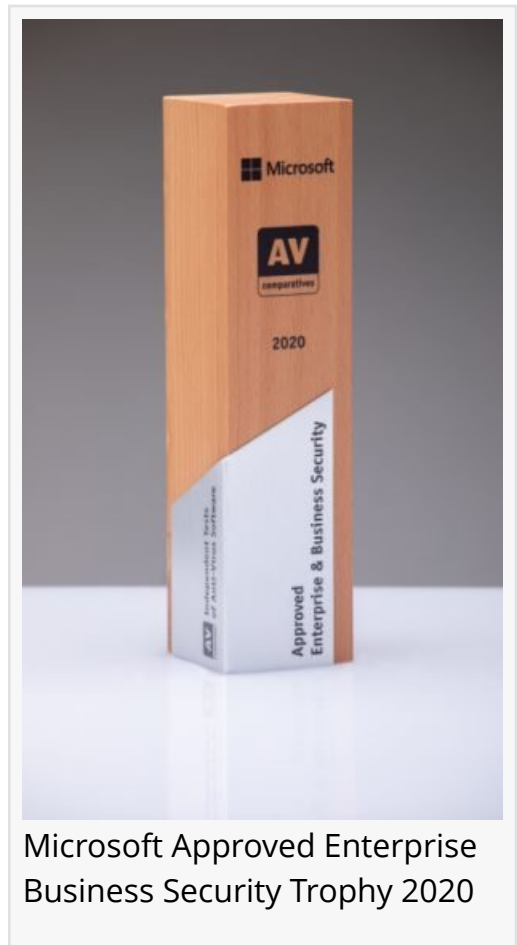
Microsoft Approved Enterprise Business Security Trophy 2020

This press release can be viewed online at: https://www.einpresswire.com/article/538623941