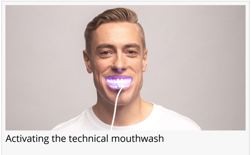
Activating the technical mouthwash

And to further combat the problem and promote good oral health amidst the pandemic, Lumoral Australia introduced a home usable technical mouthwash solution Lumoral that effectively improves plaque control.