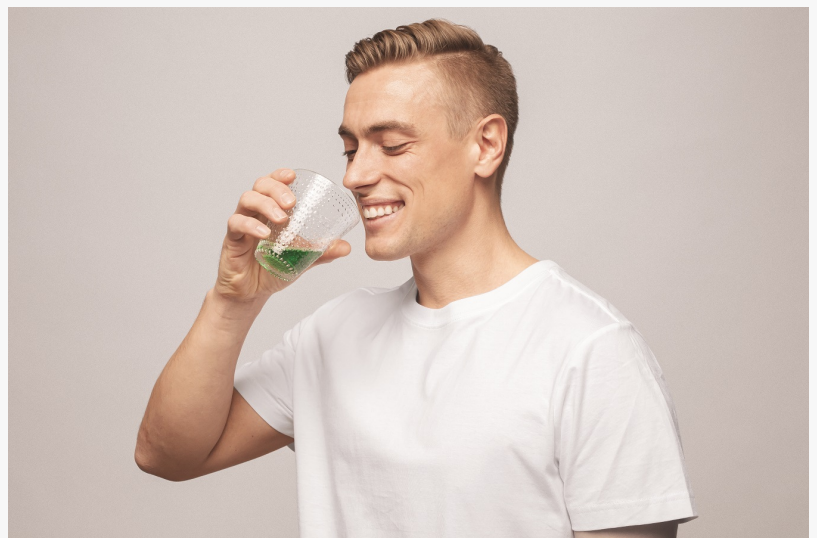
Applying technical mouthwash