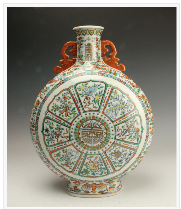
Qianlong mark porcelain moon flask accented in gold, 15 ½ inches tall, with lotus petal forms surrounding the central character medallion on each side (est. $1,000-$1,500).

This press release can be viewed online at: https://www.einpresswire.com/article/538719125