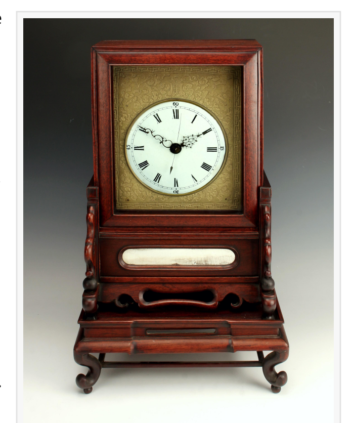
19th century Chinese bracket clock with time and strike double fusée movement, a sweeping second hand, bas relief back plate with character, tendrils and bird motifs (est. $2,500-$3,500).

On to Japan, where good things will happen in twos. One lot features a pair of vintage Japanese woodblock prints, one of a beauty in a garden, with calligraphy and an artist's mark, the other showing a beauty in a pavilion overlooking a river in springtime. Another lot includes a Japanese handmade porcelain coffee/chocolate pot in pastel colors, hand-decorated; and a brightly colored hand-painted vase with a wading bird, reeds and irises.