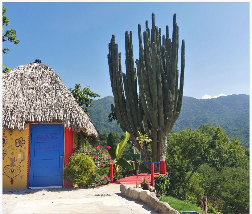
Cabana room with 400 year old Cactus