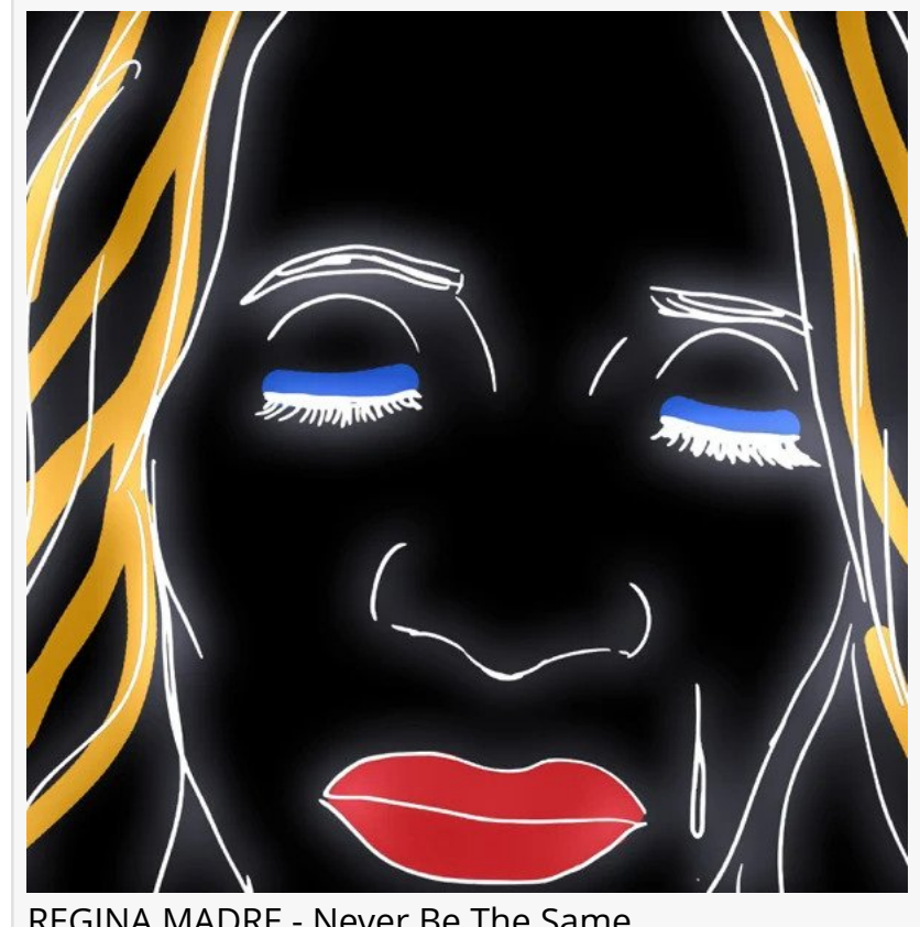
REGINA MADRE - Never Be The Same

The animated clip for "Never Be The Same" dramatizes that crisis. The video confronts infidelity, jealousy, righteousness, rage head-on and