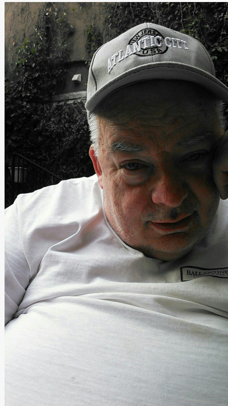
Collage Imagery Arts