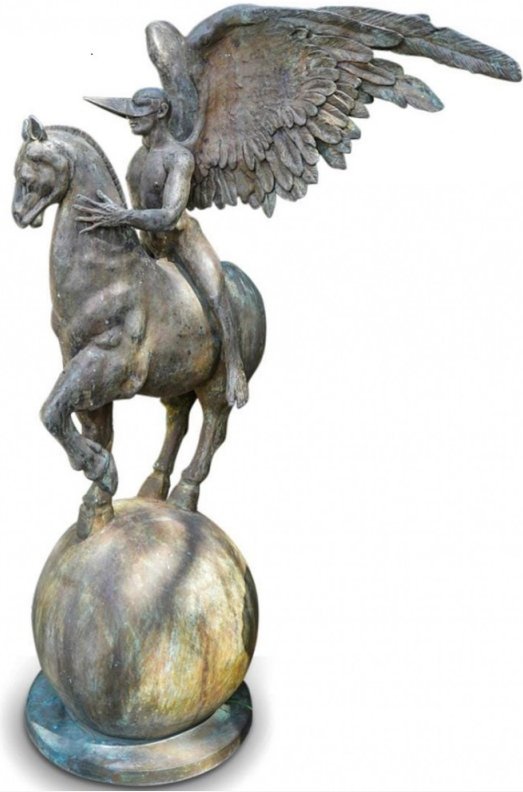
Jorge Marin (Mexican, b.1963) Figural Bronze Garden

https://www.liveauctioneers.com/item/100909832_chanel-black-embroidered-flap-bag