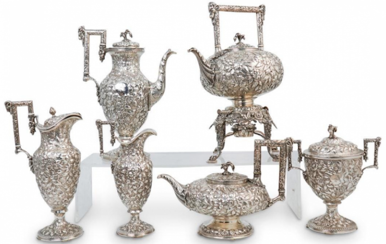
S. Kirk & Sons Sterling Silver Repousse Tea