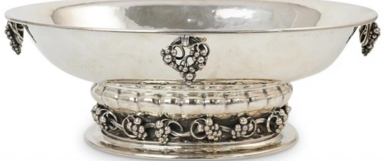
Georg Jensen Sterling Silver Centerpiece