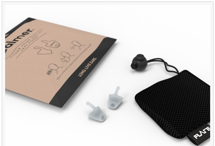
Calmer comes with a carry pouch and 100% recyclable packaging

"As a tinnitus sufferer, having young children around can be quite challenging. [Calmer] stops your ears from going into overdrive at every noise, which reduces stress a lot." RG