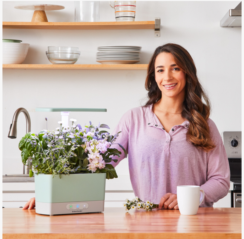
Aly Raisman with her AeroGarden Harvest Sage Wellness Garden Bundle