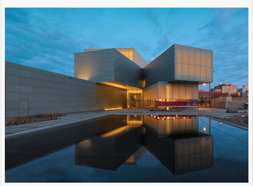
VCU Institute for Contemporary Art

not collect artwork, meaning they don't have any permanent displays. The gallery aims to display "the art of our time, which can often confront difficult themes and raise sensitive subject matter." The Institute promotes opportunities for public dialogue around the art and ideas the artists produce so that their work becomes part of national and international conversations.