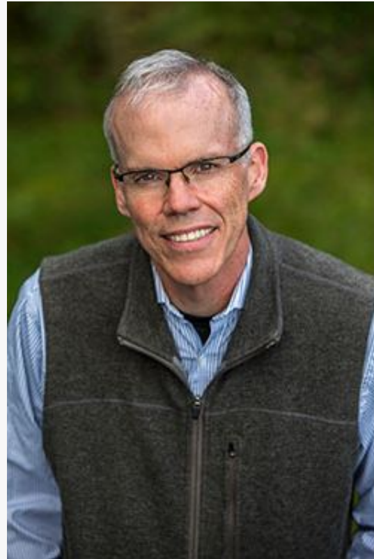
Photo of environmentalist, activist, and author Bill McKibben, who'll give keynote address at #CUNYClimateChange Conference on #EARTHDAY2021