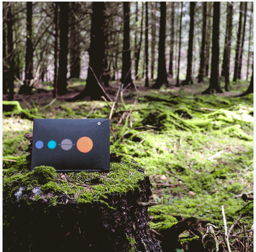
The Burgopak Earthday celebration or sustainability, an optimised packaging design in motion

Built on Holmen Iggesund's FSC certified Invercote paperboard, which is harvested from 1.3