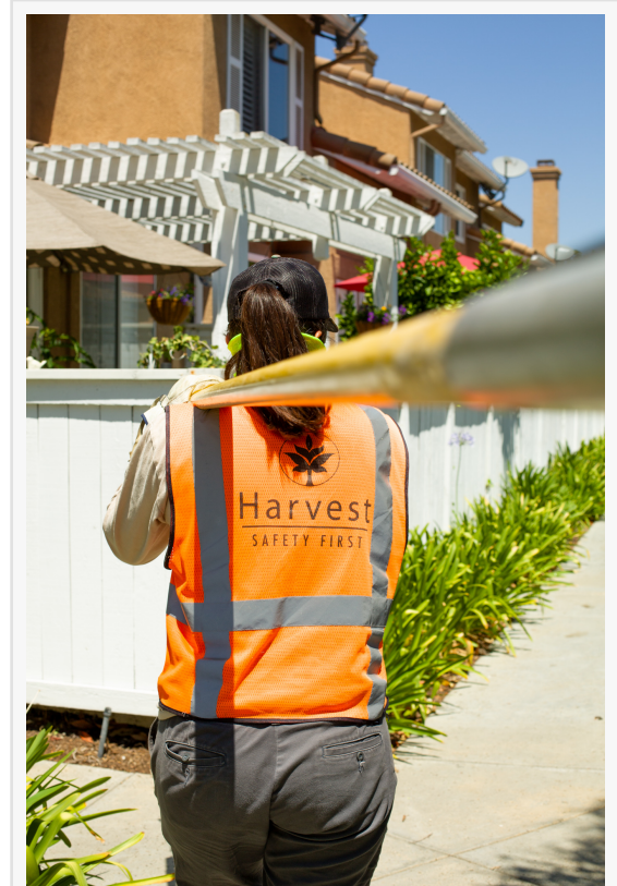
Harvest Landscape hard at work