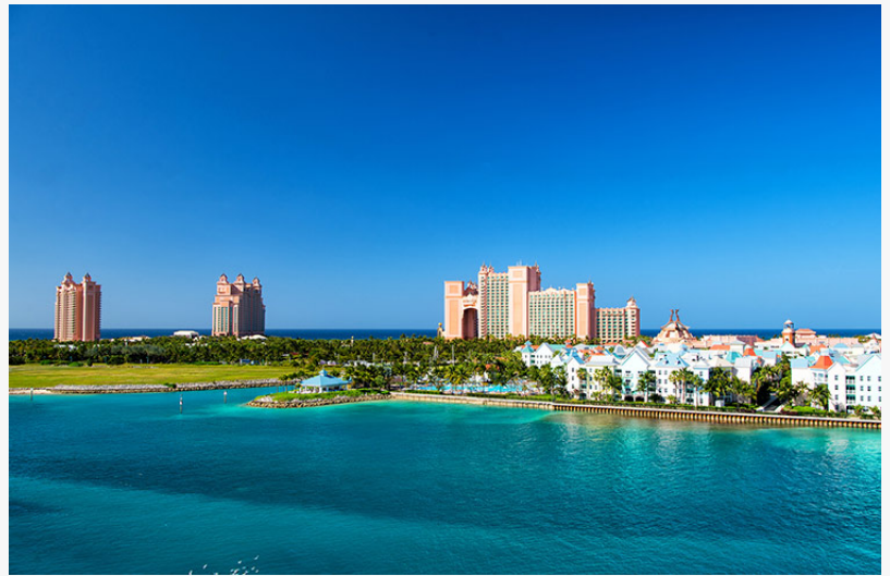
Shavon Bethel talks about travelling

Bahamas native Shavon Dion explained that the Bahamas are happy to welcome back visitors and that resorts and establishments around the country are doing as much as possible to keep travelers safe.