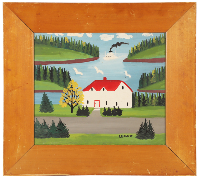
Circa 1960 painting on green board by Maud Lewis (Canadian, 1903-1970) of a local cove with the red-roofed Lynch House and ferry Princess Helene entering the harbor (CA$25,960).