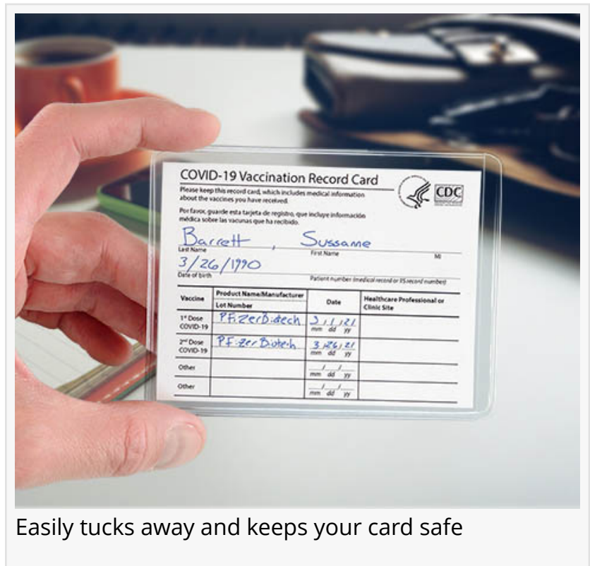
Easily tucks away and keeps your card safe