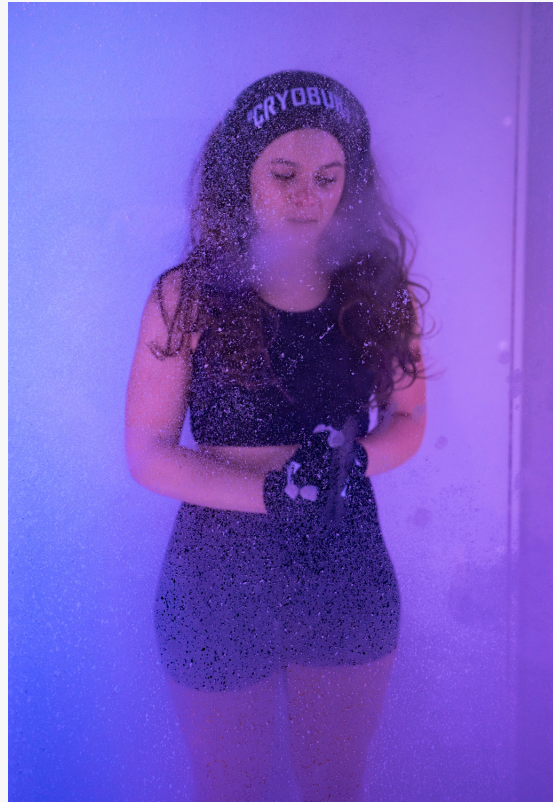
Inside the EVREST PEAK CryoBuilt Cryo Chamber