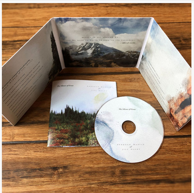
With its award winning musicians, 6-panel digipak and 18-page booklet, The Silence of Grace is a collectible collaboration album from the leaders in ambient electronic music, Spotted Peccary.