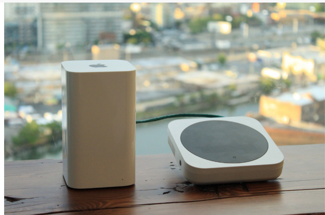
CoastFi Hotspot Program