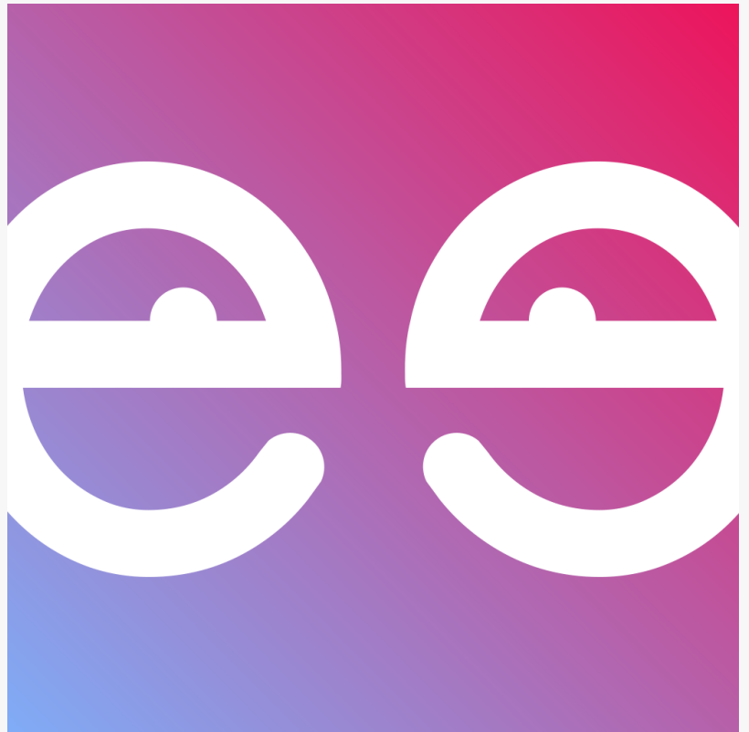
Meet Is The One-One Video Chat Marketplace For All Pros & Celebs In One.

Founder of Meet. "I came up with the idea for Meet while modeling. I knew I had fans worldwide,