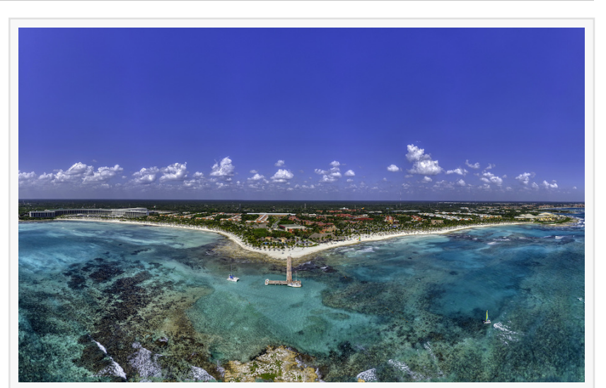
Barceló Maya Grand Resort

Turtle numbers have increased significantly since 2017 after large volumes of sargassum, invasive brown seaweed, were cleared from the beach and surrounding sea waters. From 2018