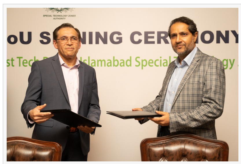
Special Technology Zones Authority and iENGINEERING Corp. Sign MOU to Build the First Technology Park in the Islamabad STZ

ISLAMABAD, PAKISTAN, April 23, 2021 /EINPresswire.com/ -- The Government of Pakistan has committed to develop the technology sector in Pakistan. The Special Technology Zones Authority has been mandated to provide legislative and institutional support to encourage investments and high-tech business in the technology zones across Pakistan.