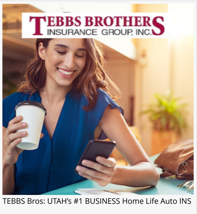
TEBBS Bros: UTAH's #1 BUSINESS Home Life Auto INS

KEARNS, UTAH, UNITED STATES, April 23, 2021 /EINPresswire.com/ -- Tebbs Brothers Insurance Group, Inc. (TBIG) has delivered quality insurance solutions to individuals in Utah and the surrounding states, specializing in Auto, Homeowners, Life and Business insurance coverage since 1982. Their team of trusted insurance professionals is committed to helping you find a policy that perfectly fits your needs. TBIG focus on providing personalized attention and exceptional customer service in order to create an experience that is difficult to find in today's market.