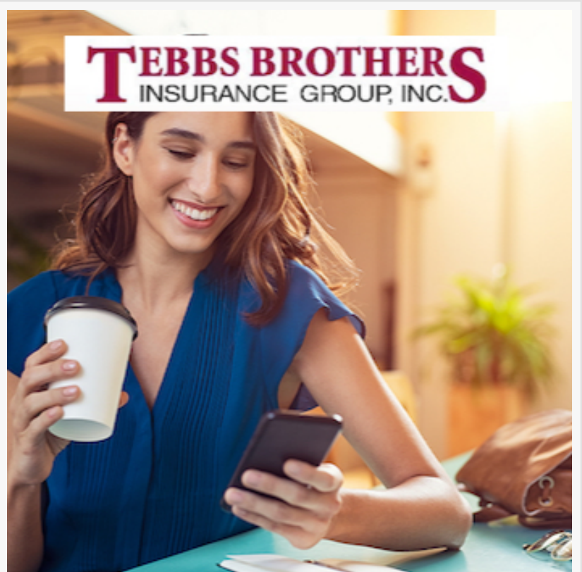
TEBBS Bros: UTAH's #1 BUSINESS Home Life Auto INS

KEARNS, UTAH, UNITED STATES, April 23, 2021 /EINPresswire.com/ -- Tebbs Brothers Insurance Group, Inc. (TBIG) has delivered quality insurance solutions to individuals in Utah and the surrounding states, specializing in Auto, Homeowners, Life and Business insurance coverage since 1982. Their team of trusted insurance professionals is committed to helping you find a policy that perfectly fits your needs. TBIG focus on providing personalized attention and exceptional customer service in order to create an experience that is difficult to find in today's market.