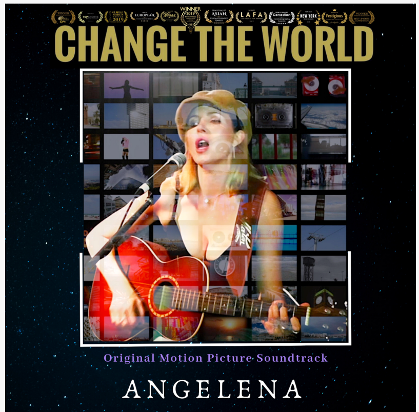
Change The World - Available Now