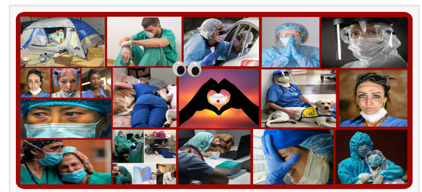
Operation Scrubs honors nurses - Covid 19's unsung frontline heroes.

LOS ANGELES, CALIFORNIA, UNITED STATES OF AMERICA, May 3, 2021 /EINPresswire.com/ -- As 2021's National Nurses Week (May 6-12) approaches, there's an exponentially growing buzz about the World Health