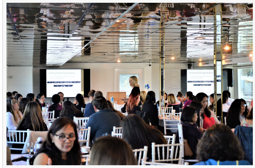
2019 concept test of Operation Scrubs innovative continuing nurse education and public awareness advocacyconcept