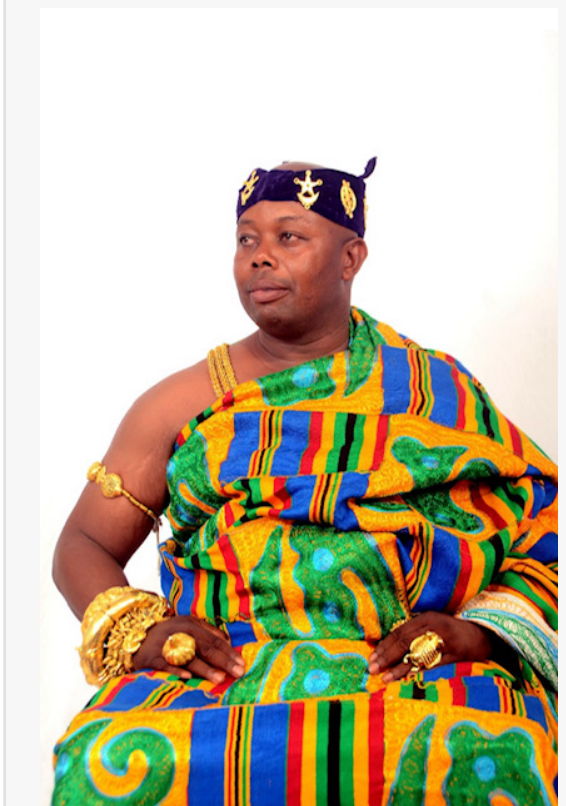
King Nana Okogyedom Eduah V of Ghana