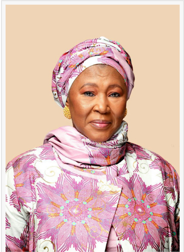
Former Vice President of Gambia, H.E. Fatoumata Jallow-Tambajang