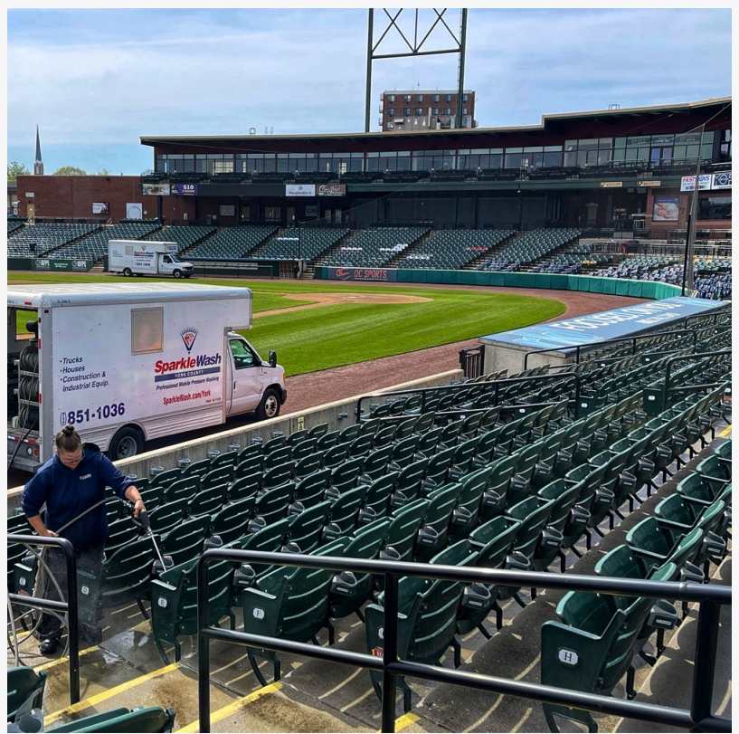
Washers Clean Stands & Chairs