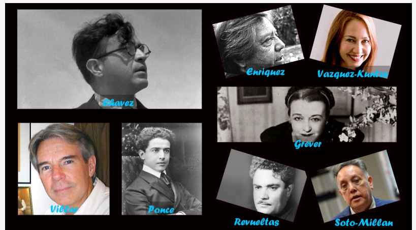
North/South May 3 Composers