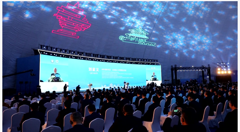
SCO Investment and Trade Expo opens

The exhibitions will be open to the public free on Tuesday and Wednesday. The SCO was established in 2001 by China, Kazakhstan, Kyrgyzstan, Russia, Tajikistan, and Uzbekistan. India and Pakistan joined as full members in 2017.