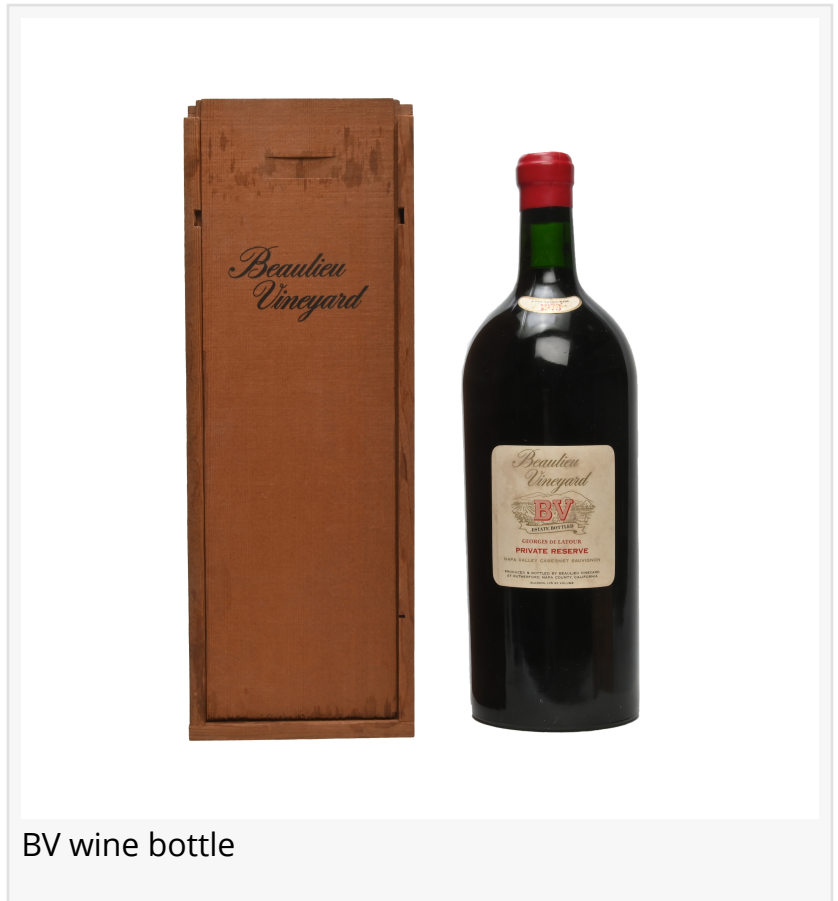
BV wine bottle

Two exciting auction events are on Michaan's calendar for May: a special Wine and Spirits Auction on Friday, May 14, followed by the monthly Gallery Auction on May 15. From the private cellars of avid collectors, fine wines from France and California are offered on May 14. Highlighted are fine Bordeaux, first and second growth, from a Sacramento collection. The auction also features very special spirits such as the bottle of Macallan single malt Scotch, Gran Reserva 1980, estimated to bring $7,000-$10,000 at auction.