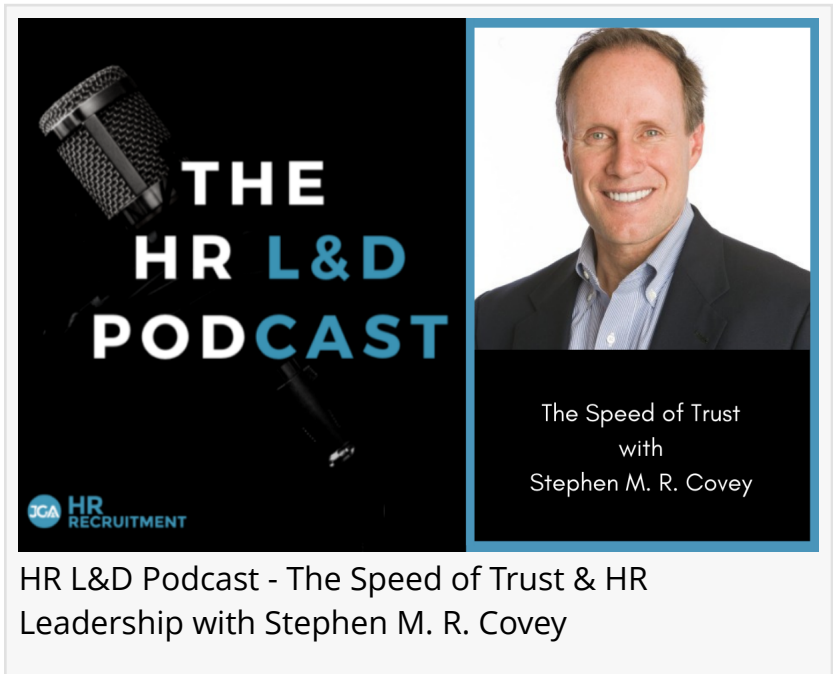
HR L&D Podcast - The Speed of Trust & HR Leadership with Stephen M. R. Covey