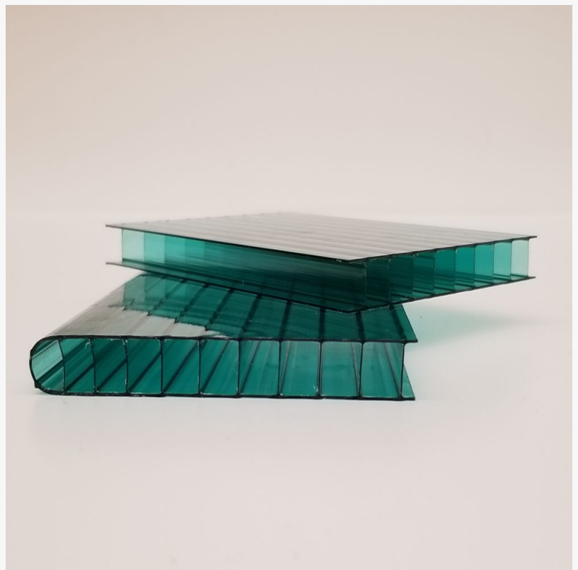
Polycarbonate multiwall in green.