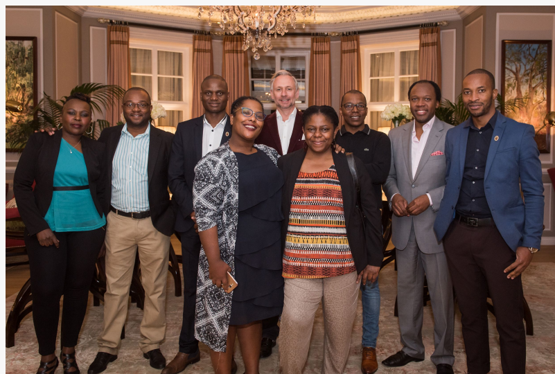
Senior members of BLACC attending an exclusive Bisquit Cognac tasting

BLACC is partnering with the Asia Pacific Wine and Spirit Institute to support minority students to begin their journey pursuing an education or a career in the wine industry.