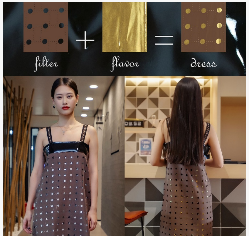
The Coffee Percolator ~ Holed dress with interchangeable inner layers