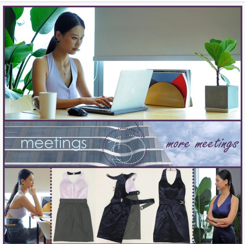
Executive Apron ~ Two-sides reversible office dress