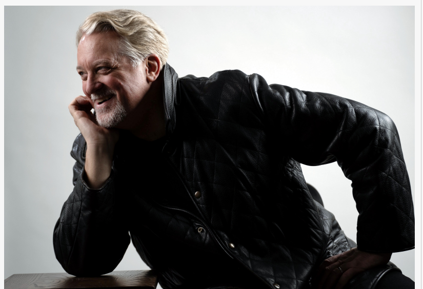
The High Plains Drifters