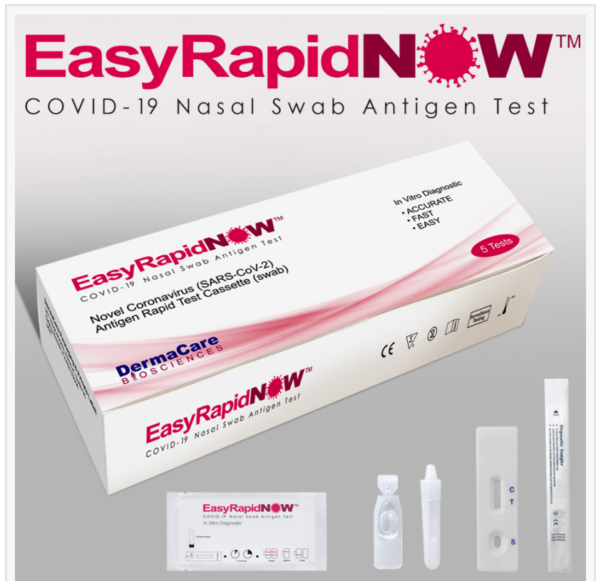
EasyRapidNOW Nasal Swab Antigen Test Kit - Help Stop the Spread!