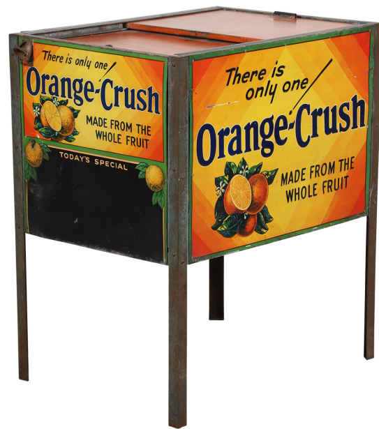
Canadian Orange Crush steel and wood store soda cooler from the 1920s, having four embossed lithographed tin panels, two with chalkboards (est. CA$4,000-$6,000).

This press release can be viewed online at: https://www.einpresswire.com/article/539796139