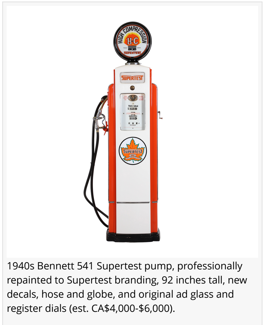
1940s Bennett 541 Supertest pump, professionally repainted to Supertest branding, 92 inches tall, new decals, hose and globe, and original ad glass and register dials (est. CA$4,000-$6,000).