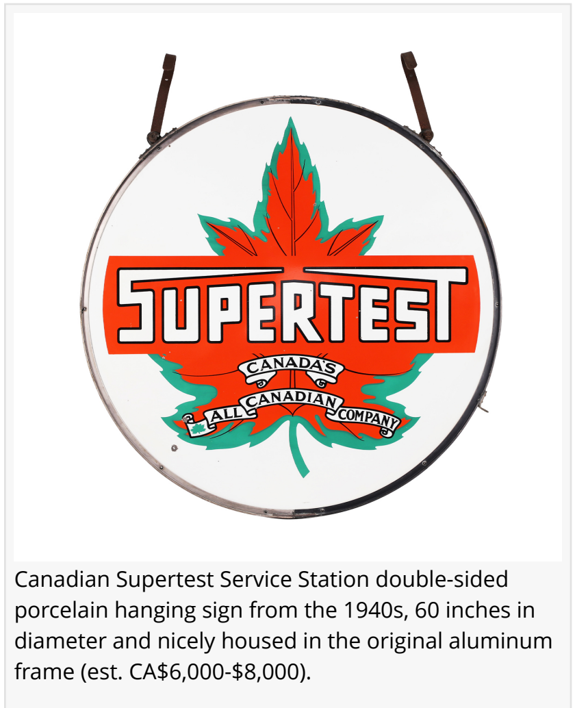
Canadian Supertest Service Station double-sided porcelain hanging sign from the 1940s, 60 inches in diameter and nicely housed in the original aluminum frame (est. CA$6,000-$8,000).

The Good Year Tires double-sided porcelain wall-mounting flange sign from the 1930s is quite rare and features Good Year's "tire around the world" graphic. The sign measures 27 ¾ inches by 20 inches and is expected to change hands for $6,000-$8,000. It exhibits minor flaws one might expect from a 90-year-old sign: minor patches of porcelain loss and a little oxidation.