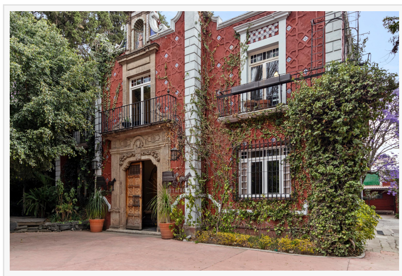
Reforma 935, Mexico City, Ciudad De Mexico, Mexico