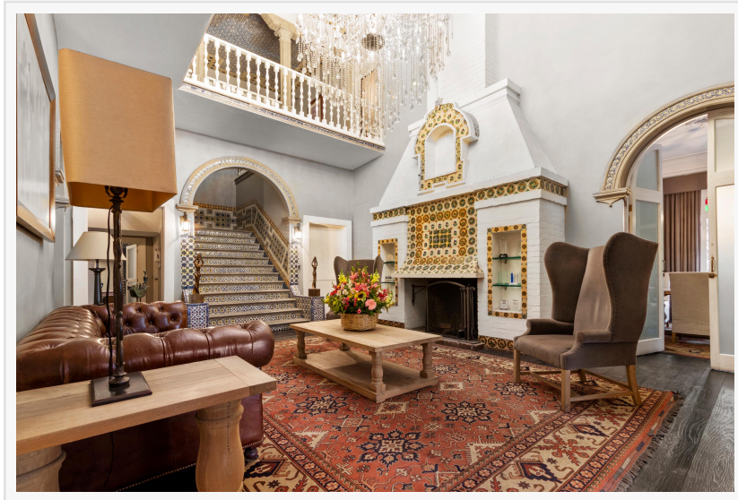
Iconic piece of authentic history in Chapultepec

Technological upgrades breathe new life into 935 Reforma's aesthetic environment, presenting the perfect opportunity to live and work, all while