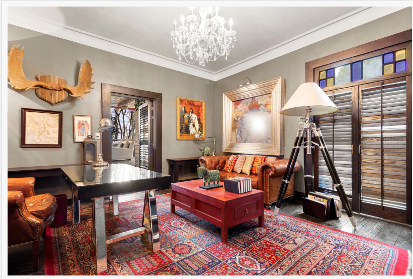
Coveted permit for office use with space for 80+ employees

Embassies, multinational corporations, and the executives who run them, live and work in the blocks stacked with multi-million dollar mansions and timeless architecture surrounding 935 Reforma. Reside steps from Castillo de Chapultepec and the National Museum of History within the castle's walls, where one can immerse themself further in the rich history and culture of Mexico itself. The nearby trendy Polanco neighborhood is home to