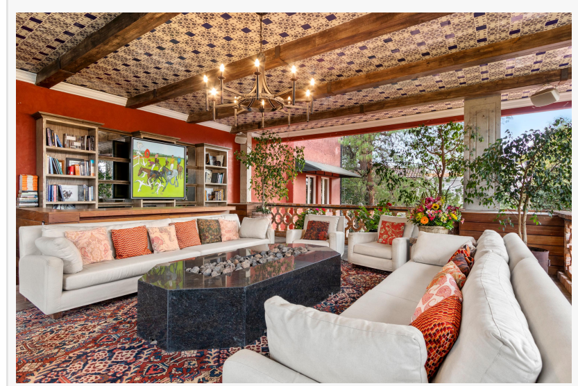
Thoughtful mix of indoor and outdoor entertaining spaces

world-famous brands and upscale international restaurants grouped along Avenida Presidente Masaryk. Like the property itself, the neighborhood and its surrounding area offers a perfect mix of modern amenities and historical charm, all tucked away in an exclusive zip code in one of the largest cities in the world.