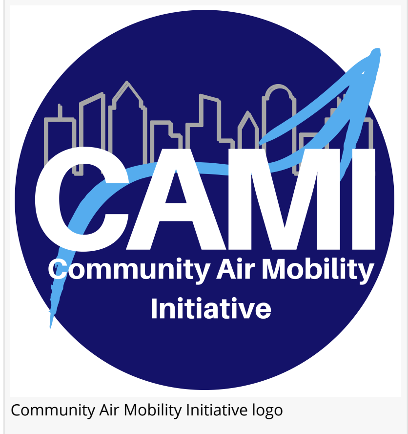
Community Air Mobility Initiative logo