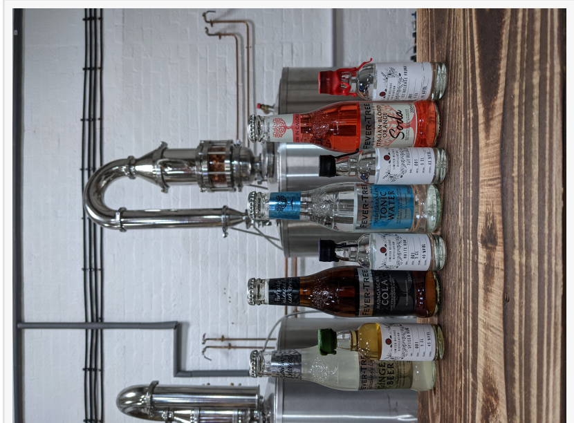
Enjoy a selection of Welsh Spirits to try during the event.

NEWPORT, WALES, UNITED KINGDOM, April 30, 2021 /EINPresswire.com/ -- The Spirit of Wales Distillery launches their first experience. A virtual tasting and tour that you can enjoy safely from the comfort of your home. Join a group or invite your friends. Expect a fun-filled night with information about our spirits, a brief distillery tour, the tasting sessions, and a fun quiz with prizes. The first event takes place over two hours on 7 May 2021 and limited to 20 people, or pre-book for future events.