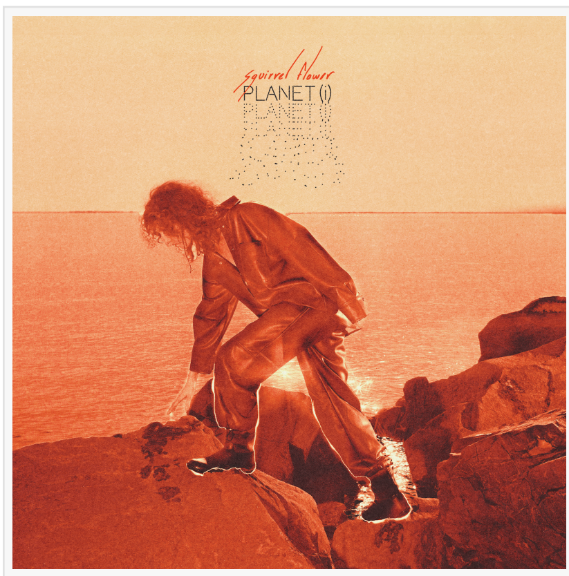
Squirrel Flower - Hurt A Fly