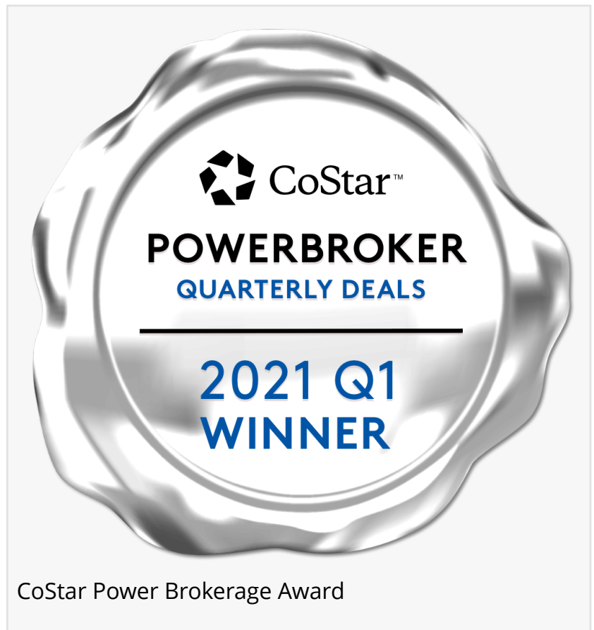
CoStar Power Brokerage Award