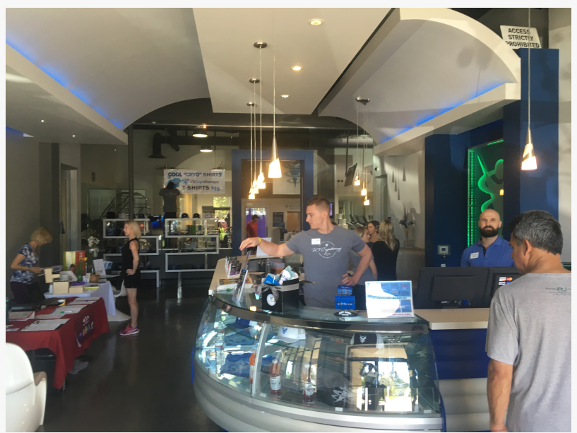
US Cryotherapy celebrated with hundreds of their loyal customers

(SEDONA, AZ) During the month of its 10-year celebration, the US Cryotherapy system also introduces its newest addition, a franchisee-owned location in Sedona, AZ, located at 164 Coffee