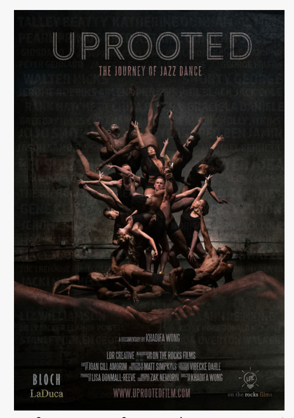
One of our many featured Documentaries - UPROOTED!

Columbia Film Festival's bright new logo!