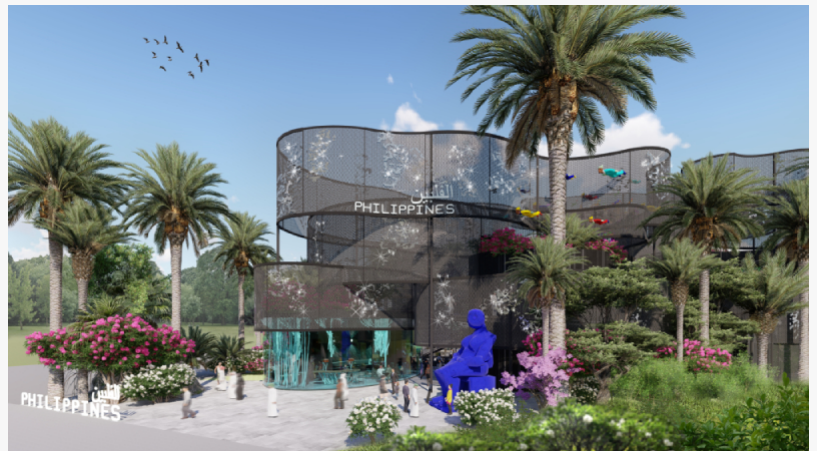
A day exterior photo of the Philippines pavilion, "Bangkóta" at the Expo 2020 Dubai