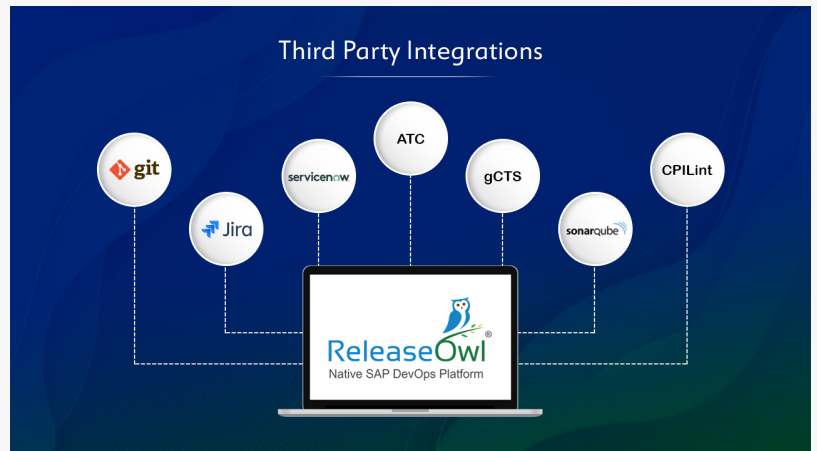
ReleaseOwl Third Party Integrations with SAP, Jira and ServiceNow