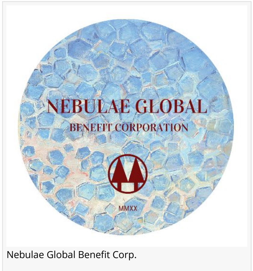
Nebulae Global Benefit Corp.

"Although our motivation is not just profit, investors can feel confident our device will be